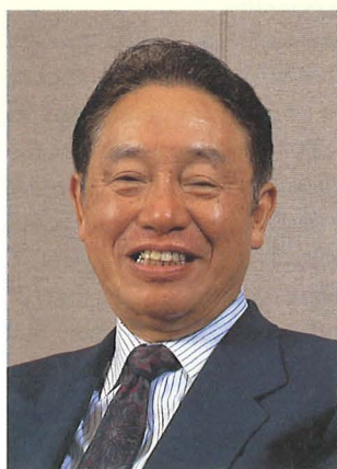
Dr. Leo Esaki