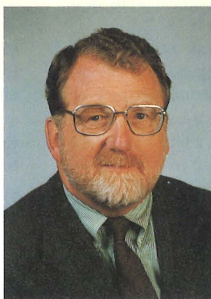
Prof. Dr. Jozef S. Schell