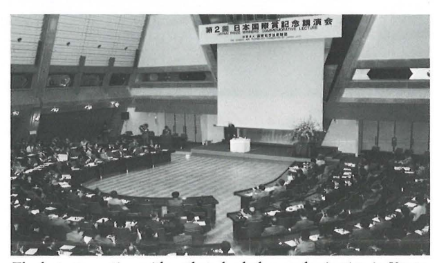
The lecture meeting with gathered scholars and scientists in Kyoto.

During their stay in Japan, both laureates were busy with full schedules that included an audience with H.I.M. the Emperor, courtesy calls on Prime Minister Nakasone and other distinguished persons, meetings with scholars, and press interviews. They also held lectures in Tokyo and Kyoto and received enthusiastic audiences on both occasions.