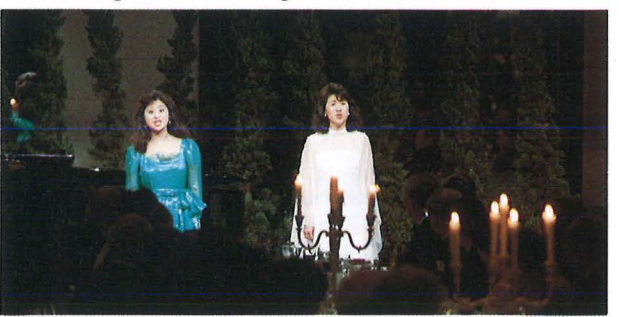
A female duet entertains banquet guests with the song, "Lullaby of a Silk Tree."