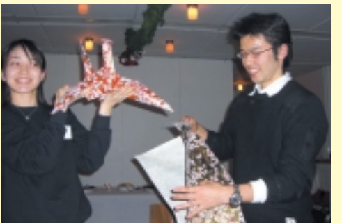
Introducing characteristic of Japan "Origami" to the other participants