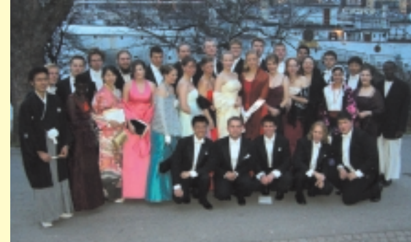
We all are ready for theNobel Prize Award Ceremony