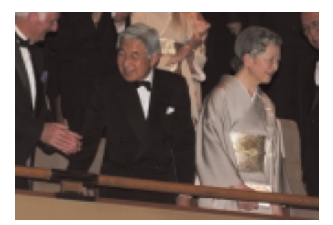
Their Majesties the Emperor and Empress listen to the commemorative concert