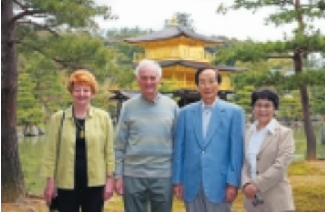
Holiday in Kyoto, April 22