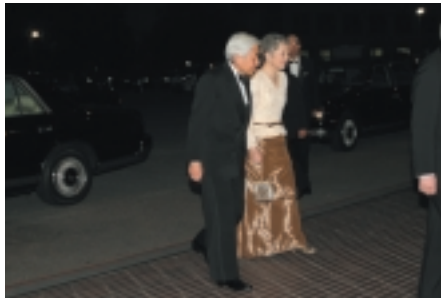
Their Majesties the Emperor and Empress arrive at the Hotel New Otani