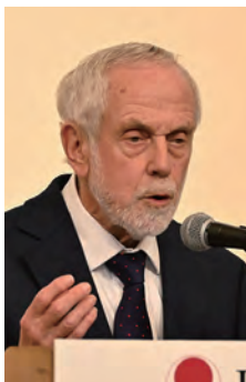
Prof. Sir Brian J. Hoskins

Field: Resources, Energy, the Environment, and Social Infrastructure