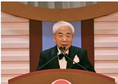
Congratulatory Speech Mr. Hidehisa Otsuji