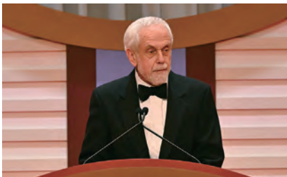
Prof. Sir Brian J. Hoskins