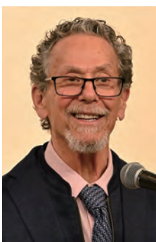
Prof. Ronald M. Evans

We subsequently focused on tropospheric disturbances in addition to gravity waves, with a particular focus on persistent circulatory abnormalities. By correlation coefficient mapping of pressure surface changes at a point having a height of 500 millibars and all other points, we successfully narrowed down the vast amount of data accumulated over many years. Remote influence patterns (teleconnection patterns) centered around reference grid points are now employed for weather prediction. For example, if a polar vortex forms over the Far East, we can predict that a cold winter will come to East Asia including Japan, resulting in an increased demand for fuel. Similarly, accumulated data on the El Niño phenomenon can be employed to predict rainfall and temperature deviation patterns and other components. We will also be able to make even more accurate weather predictions based on gravity waves and remote influence patterns.