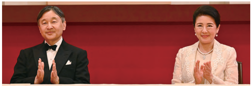
Their Majesties the Emperor and Empress applauding the recipients